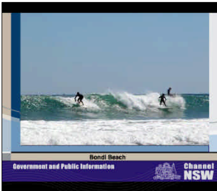
Webcam from Bondi beach as shown on Channel 45.

ac3 is hosting the New South Wales Government's digital TV service, broadcast on free-to-air Channel 45.